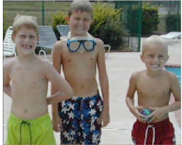
Enjoying the swimming pool has been a great way to beat the heat this summer.